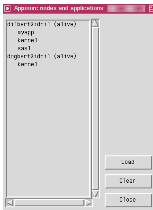
Figure 1.3: The Listbox Window.

The listbox window lists all nodes and applications. This window can be more easy to use than the normal, graphical user interface when the system consists of a large number of nodes and/or applications.