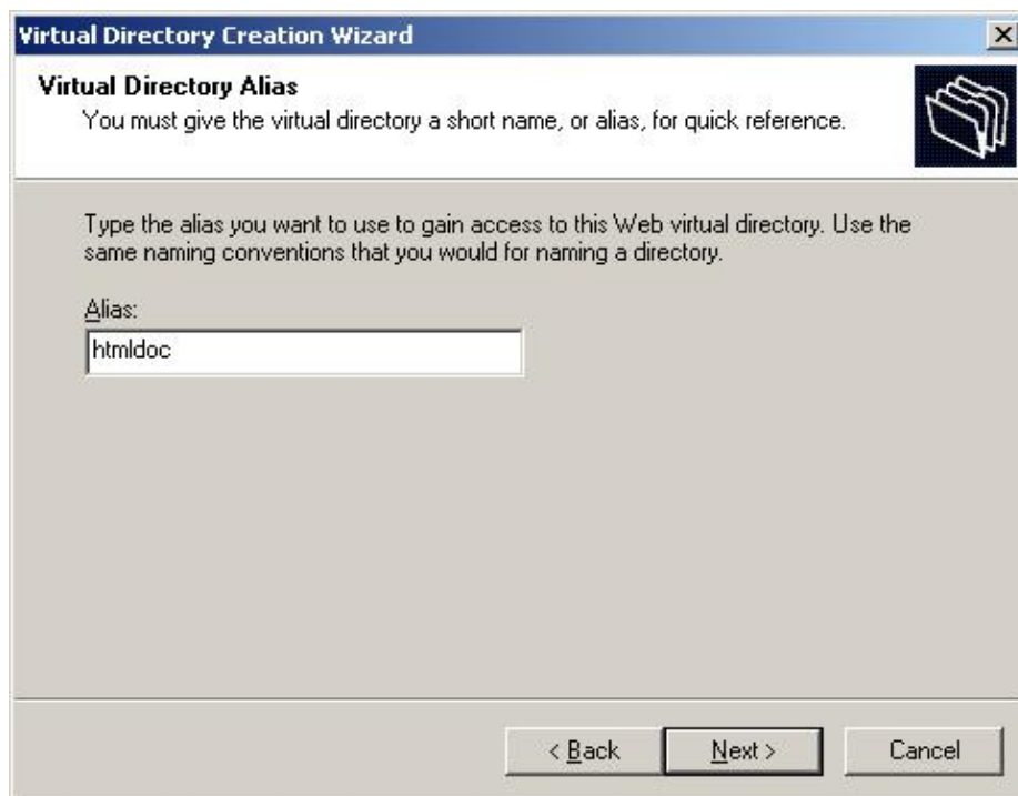
Figure 5-5: Entering the Alias Name