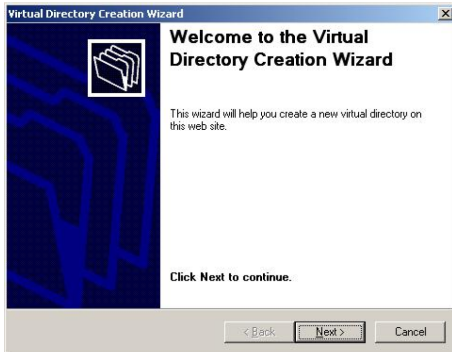
Figure 5-4: The Virtual Directory Creation Wizard Window