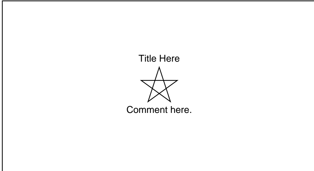
Figure 2-21: line style parameters

The star function has been designed to be useful in illustrating various line style parameters supported by pdfgen.