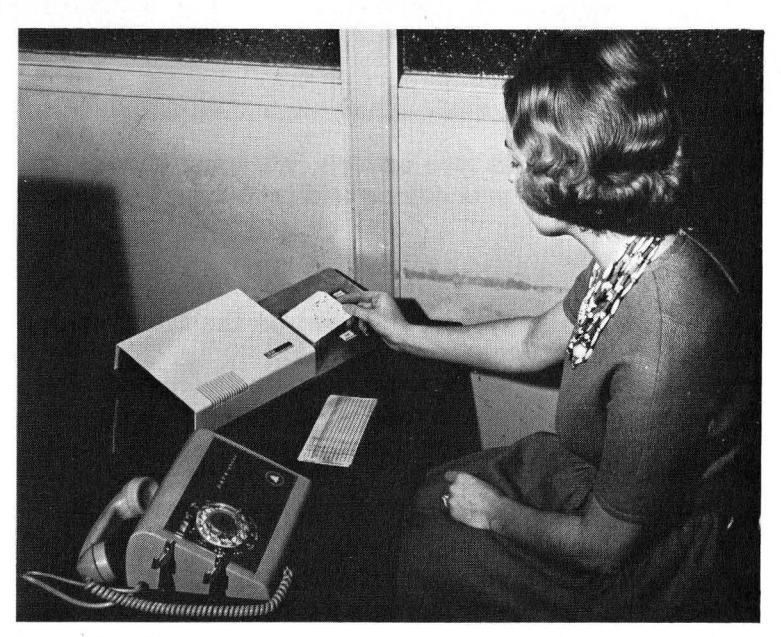
10 IBM 1001 DATA TRANSMISSION UNITS connected to a coast-to-coast private wire network provide punched card order input data.

If one of the items ordered falls below the reorder point, a work order or a purchase request is produced, depending on whether the item is made in the plant or bought on the outside. In a typical transaction of this type, the 1410 may undertake up to four operations, checking first to determine whether the item has fallen below the minimum point, whether semi-finished shelf stock needed to make the part will fall below the minimum as a result, and, if so, exactly how much material should be ordered.