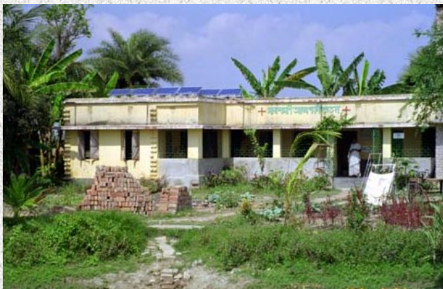
Health clinic in West Bengal, India