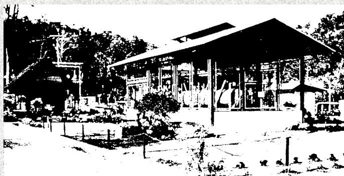
A 300-kW geothermal binary plant has operated for four years in Fang, Thailand.