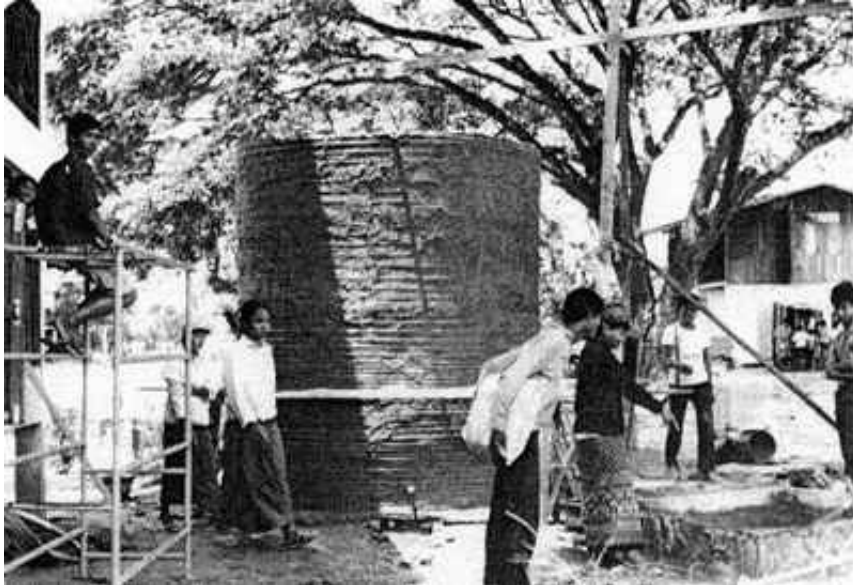
Figure 2 - a partially finished brick tank showing external rendering and hoop reinforcement (Chayatit Vadhanavikkit)