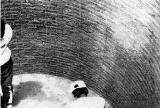
Figure 3 - inner tank wall surface showing wire mesh in place