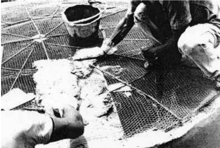
Figure 4 - roof construction for both ferrocement and brick tanks

As mentioned earlier, the roof is constructed in a similar manner to that in Case Study 11. Curing is also carried out as described here.