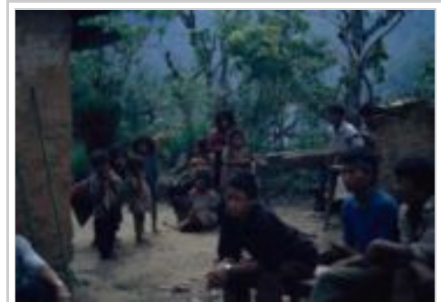
Figure 1: Chepang people training in the Kandrang Valley with an oil expeller in the background.

The diagrammatic process flow for Chiuri ghee processing is presented as follows.