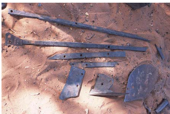
Figure 5: The plough before assembly

Practical Action has been involved the design of the harness in Sudan where improved harnesses have been introduced for ploughing and for water carrying. ITDG publishing has also produced a book on simple harnesses.