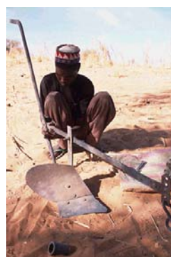
Figure 6: Assembly of the plough

The donkey plough demonstrates the relationship between the different aspects of Practical Action’s work from the adaptation of a traditional technology to the development of an intermediate technology and brings together farming, metalworking and the production of improved harnesses.