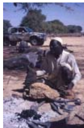
Figure 3: Metalworking in Darfur

Most of the community share the problems of working with soils that have a hard crust. When the rains come, the water cannot penetrate the soil. The project officer, at the time, introduced an implement used