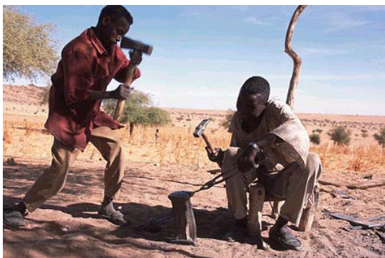
Figure 4: hammering one of the component parts of the plough

After initial trials in the project area (Kebkabiya), this technology was scaled up and disseminated to other areas in North Darfur including Azagarfa Village,