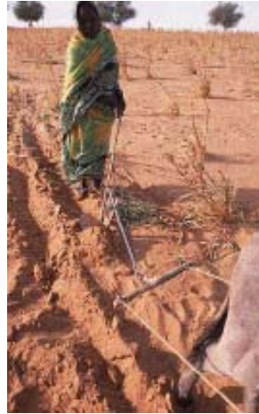
Figure 1: The plough in use in Darfur