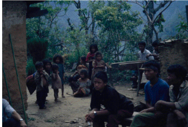
Figure 1: Chepang people training in the Kandrang Valley with an oil expeller in the background.

The Chiuri tree is a medium sized tree native to Nepal. It grows mainly in the sub-Himalayan tracts on steep slopes, ravines and cliffs at an altitude of 400 to 1400 meters, particularly in the Chitawan district. Its botanical name is Diploknema butyracea Roxb syn. Bassia butyracea , syn. Madhuca butyracea , syn. Aesandra butyracea . It is also named "butter tree". The main product of the tree is "ghee" or butter, extracted from the seeds and named "Chiuri ghee" or "Phulwara butter".