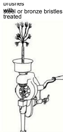
Figure 2: A small machine

Once clean, washed glassware should pass as soon as possible to the packing area. It should be kept inverted in boxes to prevent dust and foreign bodies falling in through the necks.