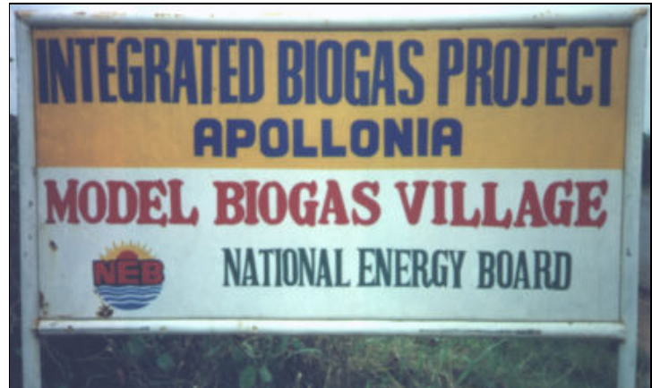
Sign of the National Biogas Department/National Energy Board in Ghana