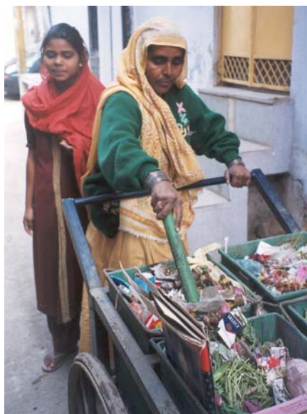
Photo 1: Door-to-door solid waste collector in Delhi

Waste is generated by a range of stakeholders including: pedestrians, households, businesses, markets, industries and healthcare facilities. Therefore solid waste can also include toxic waste (e.g. chemicals from industry), biological waste (e.g. dressings from hospitals) and occasionally faeces (e.g. from nappies). These hazardous wastes require specialised treatment and disposal, not discussed in this technical brief. The source of waste often determines its quantities and characteristics. In developing countries waste generated from various sources is often combined at collection and disposal, so due care must always be taken to ensure the health and safety of those involved in waste management.