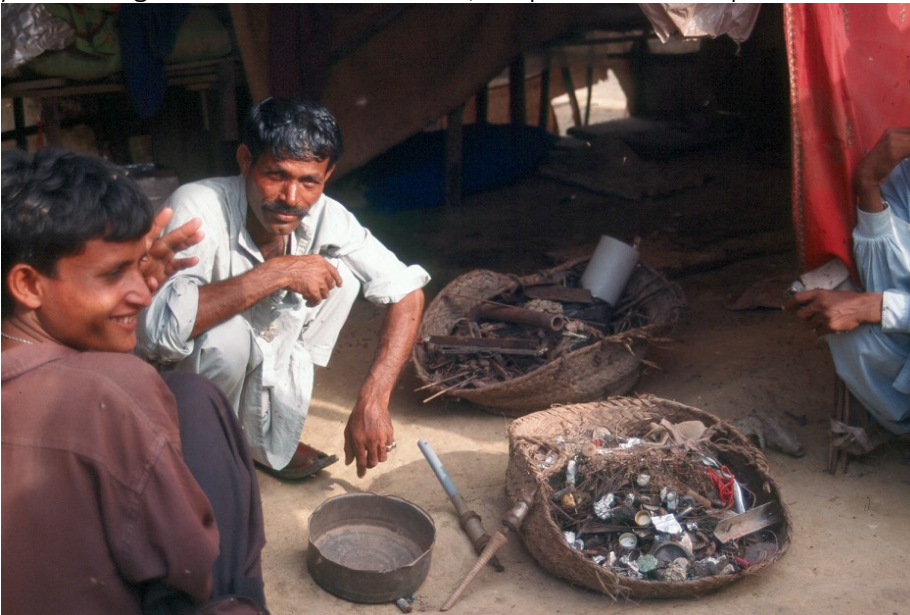
Photo 2: Recyclable materials dealer in Pakistan.

Many cities have active recycling sectors. This is predominantly an informal-sector activity, and can provide employment for tens of thousands of urban poor in a single city (photograph 2). Where the sector is particularly well developed, influential businessmen may have vested interests in retaining control. Efforts of SWM planners may be best directed at regulation and support: for example ensuring recycling workers are properly protected from health and safety risks, and that businesses access recyclable materials as close to the point of generation as possible (e.g. collected from households, not picked from a disposal site).