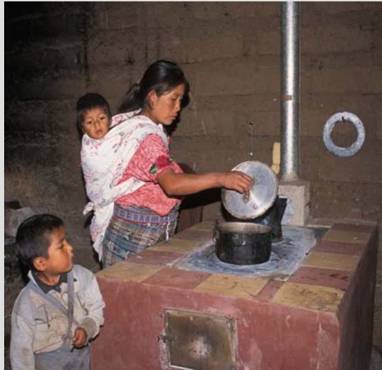
Figure 1: Woman using improved stove, Guatemala

At the end of the work, the remaining households in the study are provided with stoves.