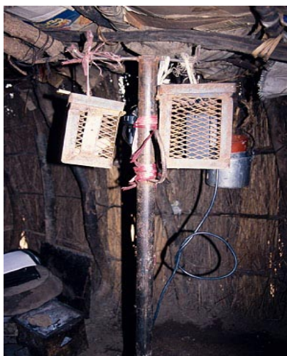
Figure 7: Equipment in metal cages – Sudan monitoring.

A particulate pump and a CO monitor are set close together 1.3m vertically and 1.3m horizontally away from the stove and monitoring is conducted for 24 hours. Where possible, the equipment is set away from walls and draughts. In Figure 7, from Sudan, it can be seen that all the electrical equipment is housed in locked 'cages' to prevent children from tampering with it.