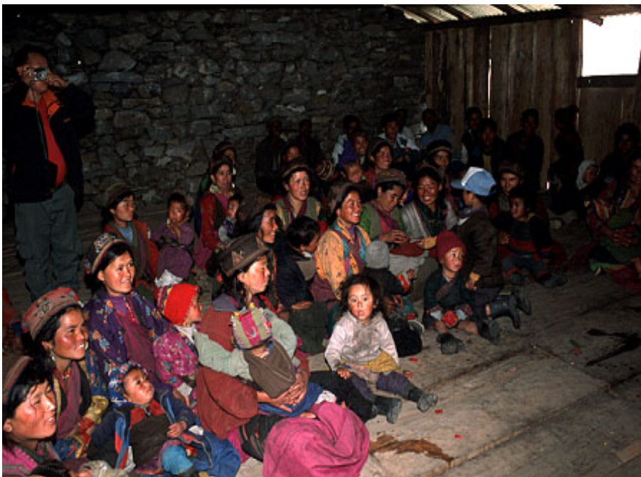
Figure 2: Nepal community meeting

Community participation (Figure 2) is essential from the start. Representative households should be identified by the community themselves, although various criteria can be required - eg children under five; enthusiastic to work with the project. Community meetings and discussion will promote participation and ensure that findings are relevant to the project communities.