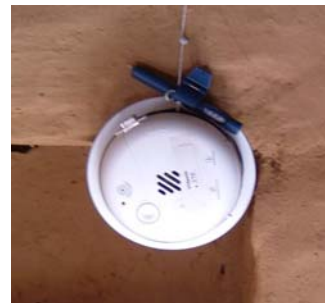
Figure 4: UCB monitor

The UCB monitor (Figure 4) relies on sensors from an inexpensive commercial household smoke detector that combines ionization chamber sensing (ion depletion by airborne particles) and photoelectric sensing (optical scattering by airborne particles) (UCB, 2006).