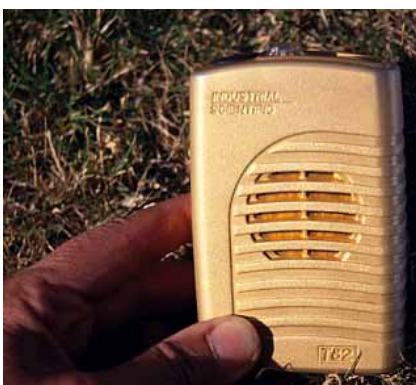
Figure 5: T82 Carbon monoxide monitor

There are two main types of equipment for monitoring carbon monoxide in this type of work. The first is a 'stain tube', which is a small tube, made of robust glass inside which is a sensor which changes colour with exposure to the gas. These tubes are useful if only a small number of measurements are to be made, but as they can only be used once, they are expensive for larger numbers of samples. They give an indicator of CO levels, but are difficult to interpret accurately and do not give real time data. Practical Action uses real time monitoring of carbon monoxide. The equipment is an ISC-T82 single gas monitor made by Industrial Scientific (Figure 5). Once monitoring has taken place, the data can be downloaded to computer using a T82 datalogger to computer. Software enables the user to look at graphs of levels of carbon monoxide with time, as shown in Figure 6.