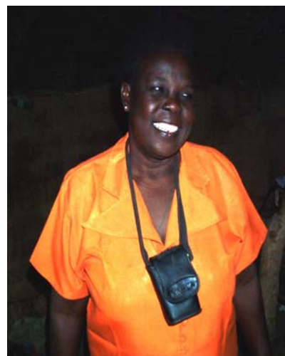
Figure 8: Woman wearing CO monitor around neck (photo: Practical Action).