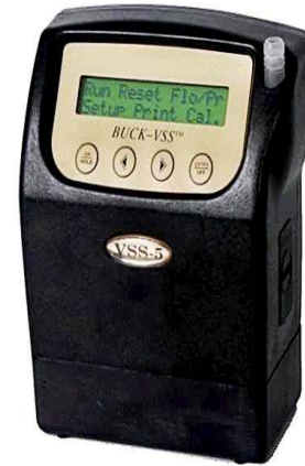
Figure 3: Buck low-flow sampling pump

Monitoring is usually conducted over a whole day. This type of monitor (made by AP Buck) was used by Practical Action, and is well tried and tested, but only showed the total levels of pollution over the whole day. Some versions of this monitor (Figure 3) now measure the levels of pollution and record them minute by minute over the day (called 'real-time monitoring') http://www.apbuck.com/shop/item.asp?itemid=16 .