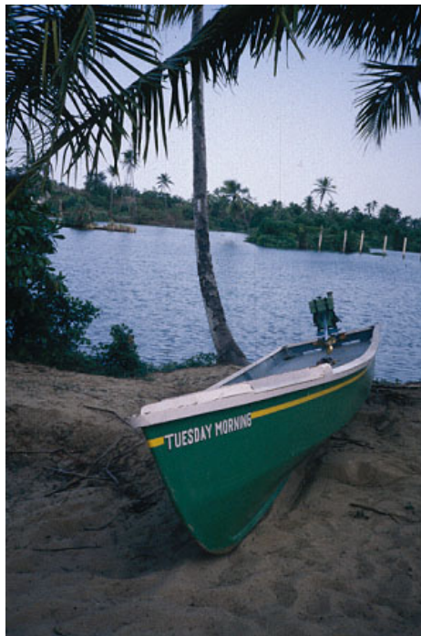
Figure 1: Ply vallum boat (stitch and glue), South India

peninsula. But the good quality fibreglass (FRP) boats built as a part of the training did not interest the majority of the fishermen of the region, who used kattumarams and canoes for fishing. The boat-builders then began to make flat bottom plywood boats, but these did not arouse the curiosity of the fishermen either, since the boats needed mechanical propulsion and the initial costs were still relatively high. The boat-builders soon learned that although they could make quality boats, they could not sell them. Pursuing the 'prototype' approach to innovation diffusion without a keen understanding of the needs of the market contributes more to boat design history than to solving technological problems.