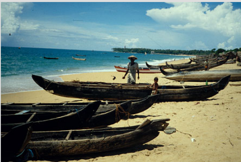
Figure 2: Traditional boats in South India.

This is the main craft type of South Kerala and the Kanyakumari District of Tamil Nadu, where the South West Monsoon surf conditions are the most severe. Literally a tied-log raft (in the Tamil Language Marram means log, and Katu means tied). It is constructed of light-weight timber logs (Albizia or Kapok) which are shaped and lashed together to form a very sea-worthy craft.