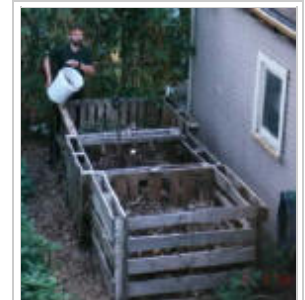
Emptying into the composting chamber

This simple composting toilet system is inexpensive both in construction and to operate and, when properly maintained, aesthetic and hygienic. By closing the human nutrient cycle, it is a perfect compliment to organic gardening. In many ways it out-performs complicated systems costing hundreds of times as much! Although it may lack appeal in first world countries with their expensive, "out of sight, out of mind" sewage systems, it may be highly appropriate in areas that lack such complex infrastructure. However, there seems to be an explosion of interest in sustainability, and many