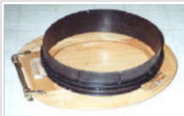
The seat with flange attached

You will also need a compost chamber; mine is constructed from recycled wooden pallets held together by wire at the corners.