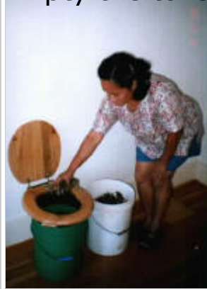
Covering with organic material

Empty the toilet contents into a composting chamber (see photo)