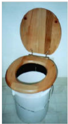
The sawdust toilet

and then becomes the sawdust bucket after filling with clean sawdust. The whole toilet system,