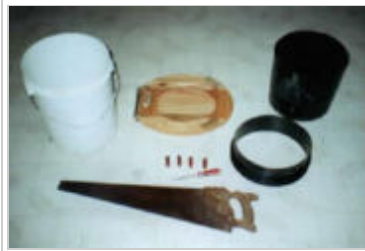
The tools and materials