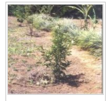
Fig 16:Plant with pitcher irrigation

Ariyabandu R D E S, Lanka Rain Water Harvesting Forum, 1998 Water Harvesting: a manual for the design and construction of water harvesting schemes for plant production by Critchley W, Siegert K, Food and Agriculture Organization of the United Nations (FAO), 1992