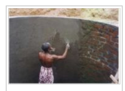
Fig 12: Plastering the tank

1 Sri Lanka Rupee (LKR)= 0.005374 British Pound (GBP)