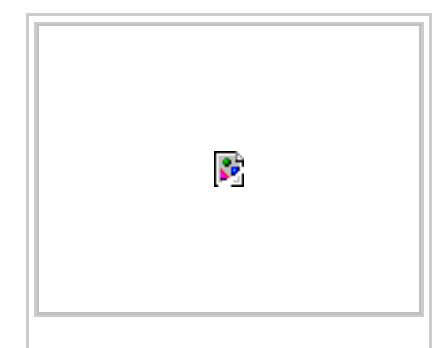
Fig 2: Measurement taken for the radius of the tank.

• After the slab of concrete is hardened and has completely dried, construct the walls one foot in height from the inlet with a width of one brick. It is important to use bricks with dimensions of: 5cm x 10cm x 23cm for this purpose. The cement mixture should have a ratio of cement to sand of 4:1.