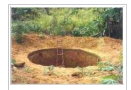
Fig 3: Pit for the tank construction