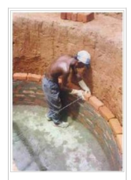
Fig 5: Wall construction of the tank on the concrete base