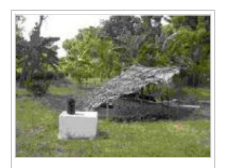
Fig 15:Thatched hut, fence protecting the rainwater harvesting tank

Micro irrigation (Practical Action Technical Brief) Small-scale irrigation by Peter Stern, ITDG Publishing 1994 ISBN 0 903031 64 7 Rainwater Harvesting: the collection of rainfall and runoff in rural areas by Pacey A, Cullis A ITDG Publishing, 1986 ISBN 0-946688-22-2