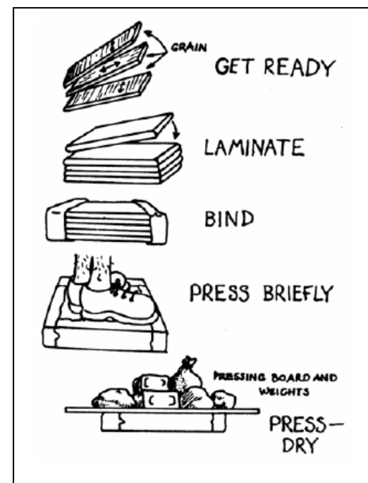
Figure 2: Laminating - work quickly, race-the-stretch

Laminate the boards, roll the tubes, and let them all dry.