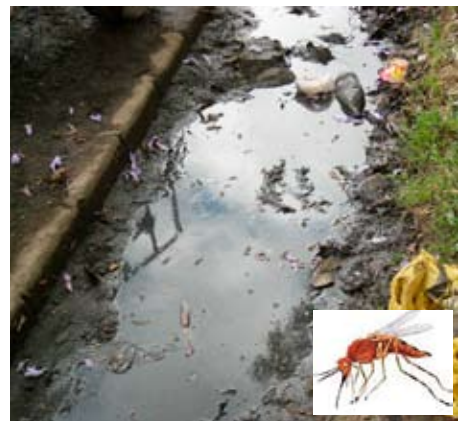
Stagnant water pools are the breeding ground for mosquitoes.

Malaria kills thousands of people in Kenya every year, but for the coastal town of Malindi, the disease had attained epidemic proportions, affecting more than 80 per cent of all children between the ages of 2 to 9 years and more than 50 per cent of pregnant women. Realising the danger posed by the disease, a number of community groups came together 6 years ago to educate the residents on ways of controlling the disease. The local youth formed 250 Self-Help groups under an umbrella organisation by the name Punguza Mbu Malindi (PUMMA). To support the initiative, The Kenya Medical Research Institute (KEMŘI) together with the African Insect Science for Food and Health (ICIPE) sent scientists to work with the community on malaria control. The BioVision Foun-