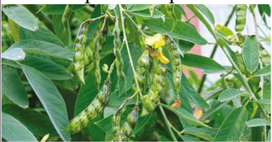
Did you know that a row of pigeon peas (mbaazi) can protect your crops from harmful pests such as spider mite? Read more about natural pest control methods on page 3