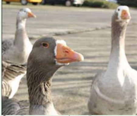
Canadian geese on the walk

- There may be dietary problems. i.e., are the geese getting enough water / the right feed including sufficient grazing / the correct housing / enough