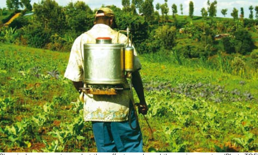
Chemicals are easy to use but they affect people and the environment.

But as we have mentioned before, farmers are already having problems with a range of chemical pesticides that do not work against the same pests anymore. This means that the continued use of pesticides has made the pests to develop resistant traits that enable them to survive pesticide application. To go round this problem, chemical companies are being forced to develop stronger pesticides that can kill the pests; but some of the chemicals being used have serious side effects, not only to the environment but also to other beneficial insects that control these pests naturally. Most chemicals in the pesticides do not break down completely when used on target crops; chemical residues remain on the crop to the time of harvest which has dangerous side effects to people who eat food prepared from such crops. Some of the side effects include allergies,