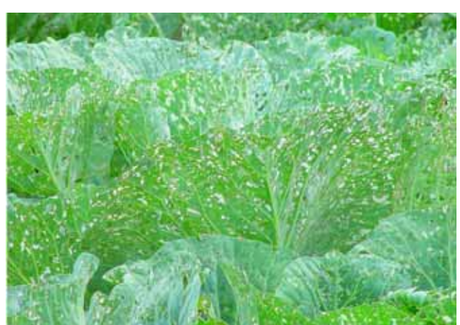
Nothing left to harvest: Infested cabbage