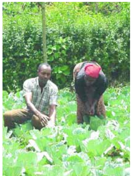
Releasing wasps in the field near Karatina

enemies), which are a major feature of Integrated Pest Management. The project commenced with a survey in the major cabbage growing areas in Kenya, Uganda and Tanzania, which showed that existing enemies were not providing a big enough impact in control of the Diamondback Moth. ICIPE therefore imported an exotic parasitoid, a parasitic wasp (Diadegma semiclausum), already being used in a number of countries in South East Asia (Taiwan, Indonesia, Mainland China). The wasp stings the Diamondback Moth larvae, lays its eggs, which hatch into larvae, which feed on the internal organs of the moth causing death. The wasp's larva pupates in a cocoon inside the loosely