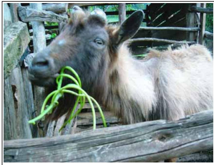
Dairy goats are becoming popular with many farmers, page 4,5