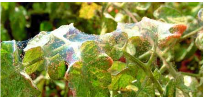
Spider mite web on a tomatoe plant. The red points on top are female adult mites waiting to be blown by the wind to the next plant for getting more food.

The two most important spider mite species (types) in Kenya are the tomato red spider mite and the twospotted spider mite. The tomato red spider mite is not native to Africa. It