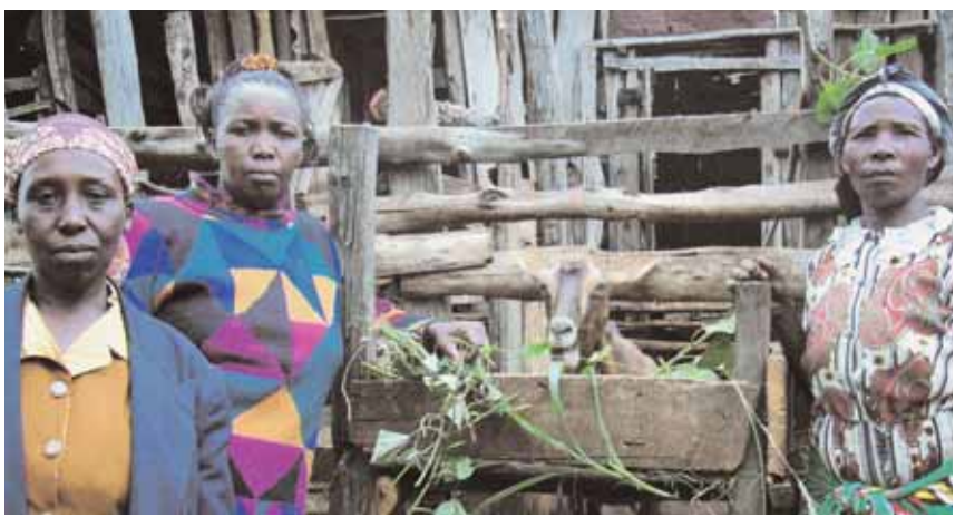
Kunyotoka Group members at their goat demonstration shed.