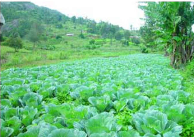
Cabbage crop 2 years after releasing wasps