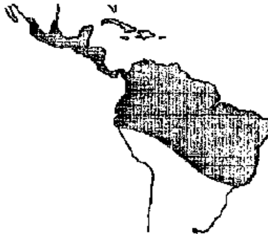
Native habitat of the green iguana

After reaching sexual maturity, at 2 or 3 years of age, females lay one clutch of 10 85 eggs each year. (For most specimens the average is probably about 35.)