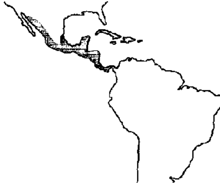
Distribution of the black iguana.