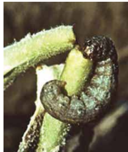
Cutworm destroys a plant stalk (TOF)

Our aim is to understand our crop requirements and in so doing, we try to make the nutrients and conditions optimum for the crop we grow. As organic farmers we must learn to read our fields, notice the differences in the