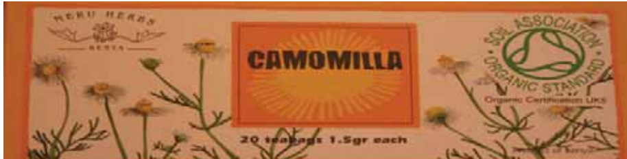
Products of Meru Herbs are certified by the UK-based Soil Association

consumer that the products are organically produced. The certification is an assurance for wholesaler and retailer and also results in bargaining power for better prices for the farmer. A "Certified Organic" product, where the certification body is recognised and respected in the marketplace, guarantees the consumer of the products integrity. In the end, the consumer is willing to pay a higher price for these certified products both for health and environmental reasons.