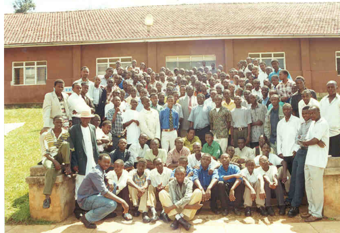
Some of the Matrich.com members assembled at