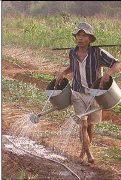
Water is a scarce resource for many farmers