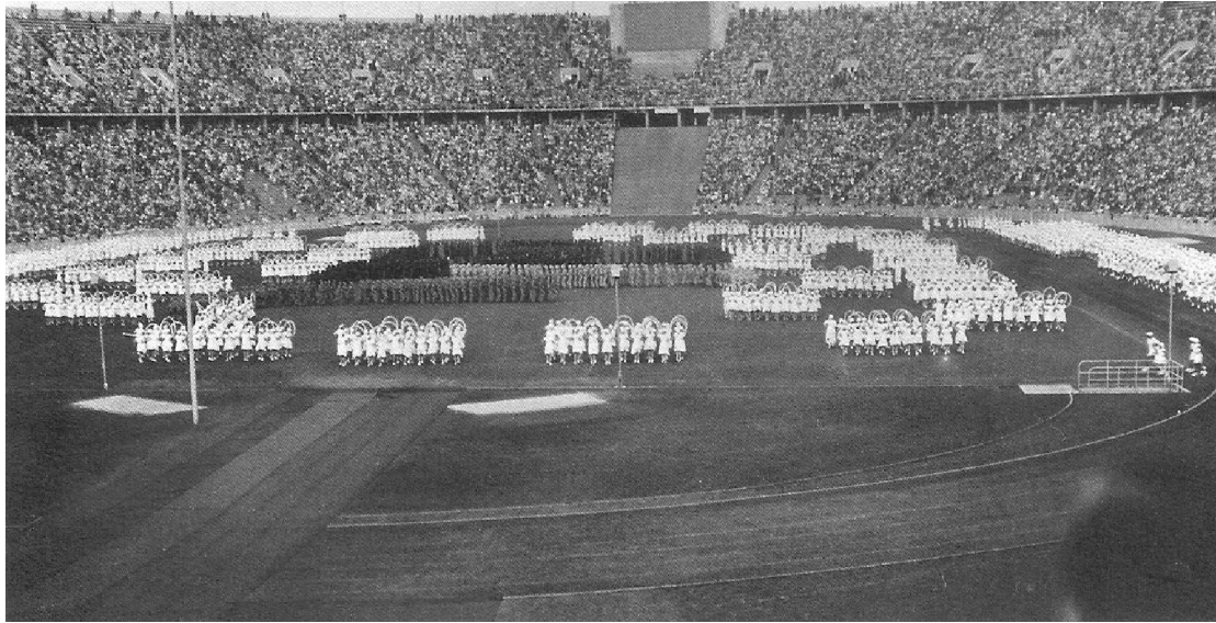
The opening ceremony of the 1936 Olympic Games in Berlin.

10 Study the photograph, and then answer the questions which follows.