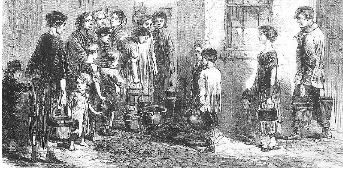
An engraving from 1862 showing a queue for water.

22 Study the illustration, and answer the questions which follow.