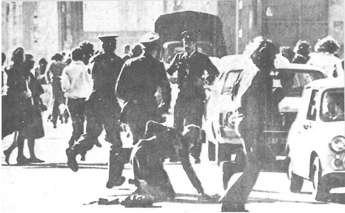
A photograph from the Cape Times, 18 June 1976. It shows people demonstrating at the South African Embassy in London.

18 Study the photograph, and then answer the questions which follow.