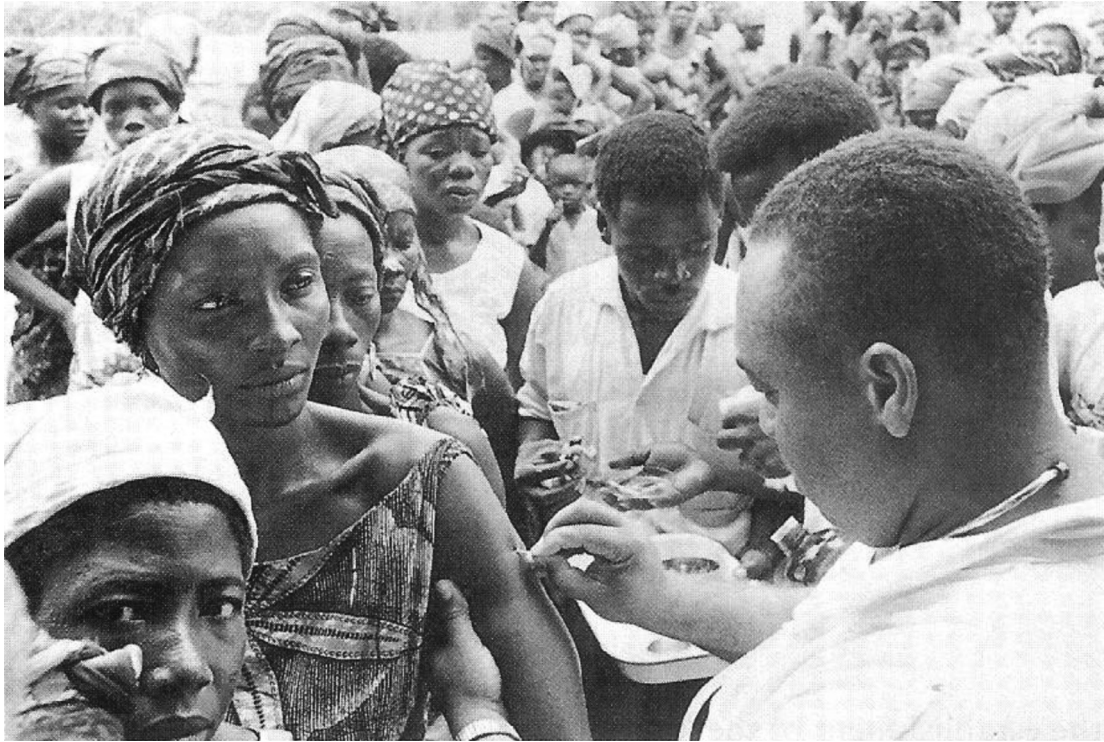
A doctor working for the WHO vaccinating villagers in the Congo to protect them against a smallpox epidemic.

8 Study the photograph, and then answer the questions which follow.