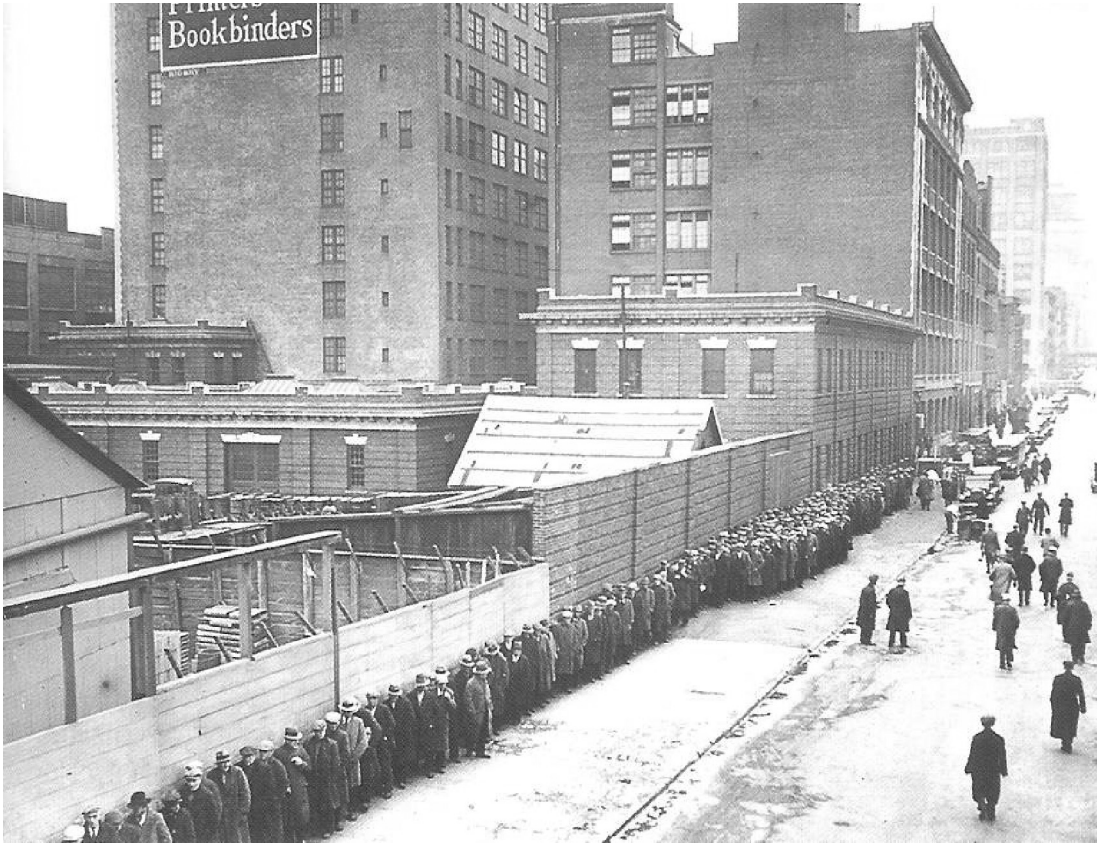
Queuing for a meal in New York, 25 December 1931.

14 Study the photograph, and then answer the questions which follow.