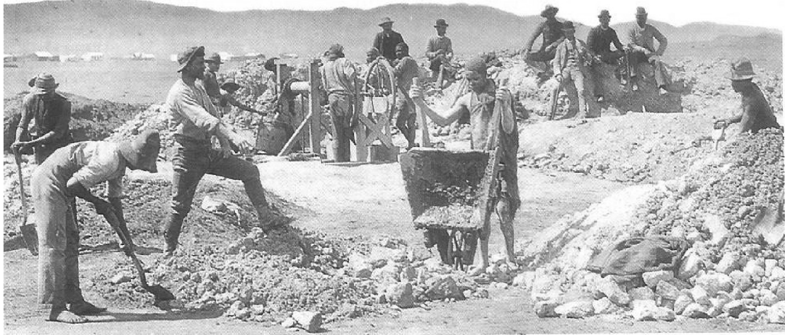
Gold mining at 'the Rand', 1888.

17 Study the photograph, and then answer the questions which follow.