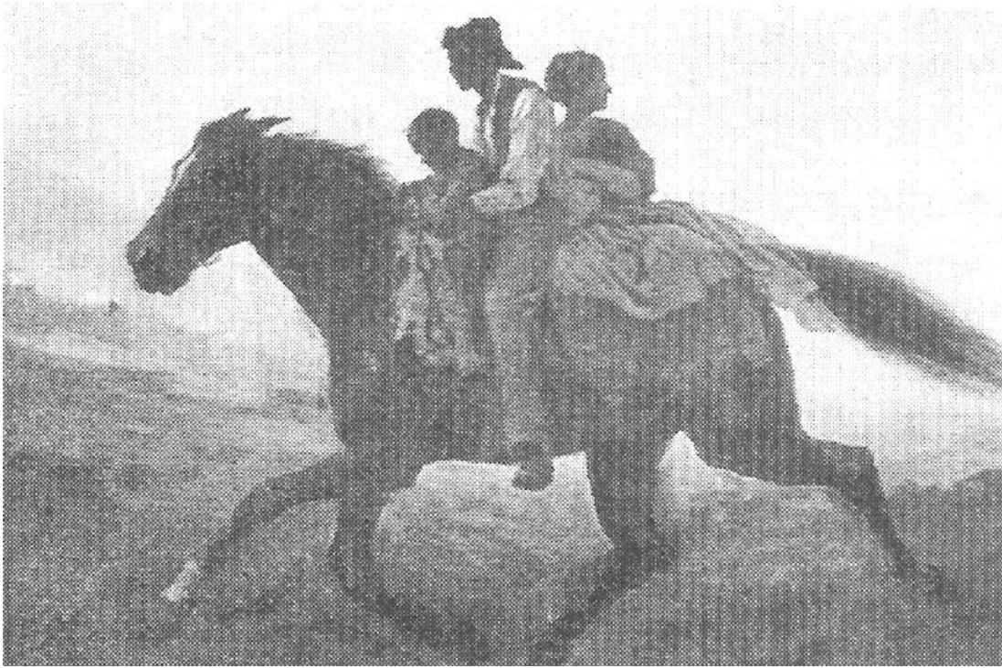
'A Ride for Liberty: The Fugitive Slaves.' An American painting, 1860.