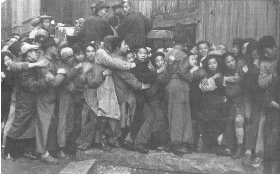
Desperate savers outside a Shanghai bank in 1948, queuing to exchange their paper money for gold before inflation makes it worthless.

15 Study the photograph, and then answer the questions which follow.