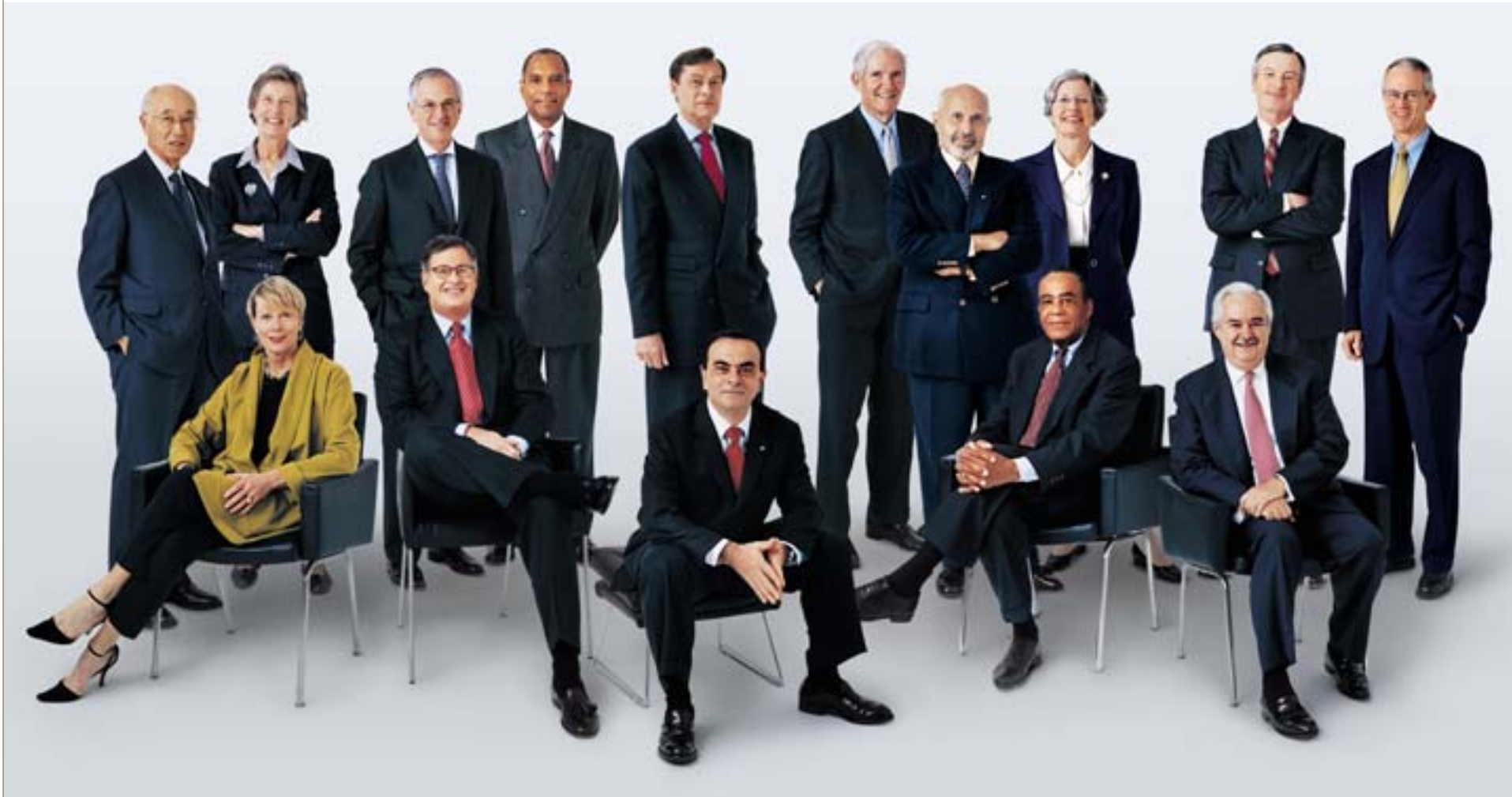
IBM BOARD OF DIRECTORS