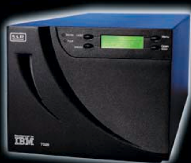
7329 Model 308 SLR100 Tape Autoloader

Reliable, economical, unattended backup for small to mid-size business servers