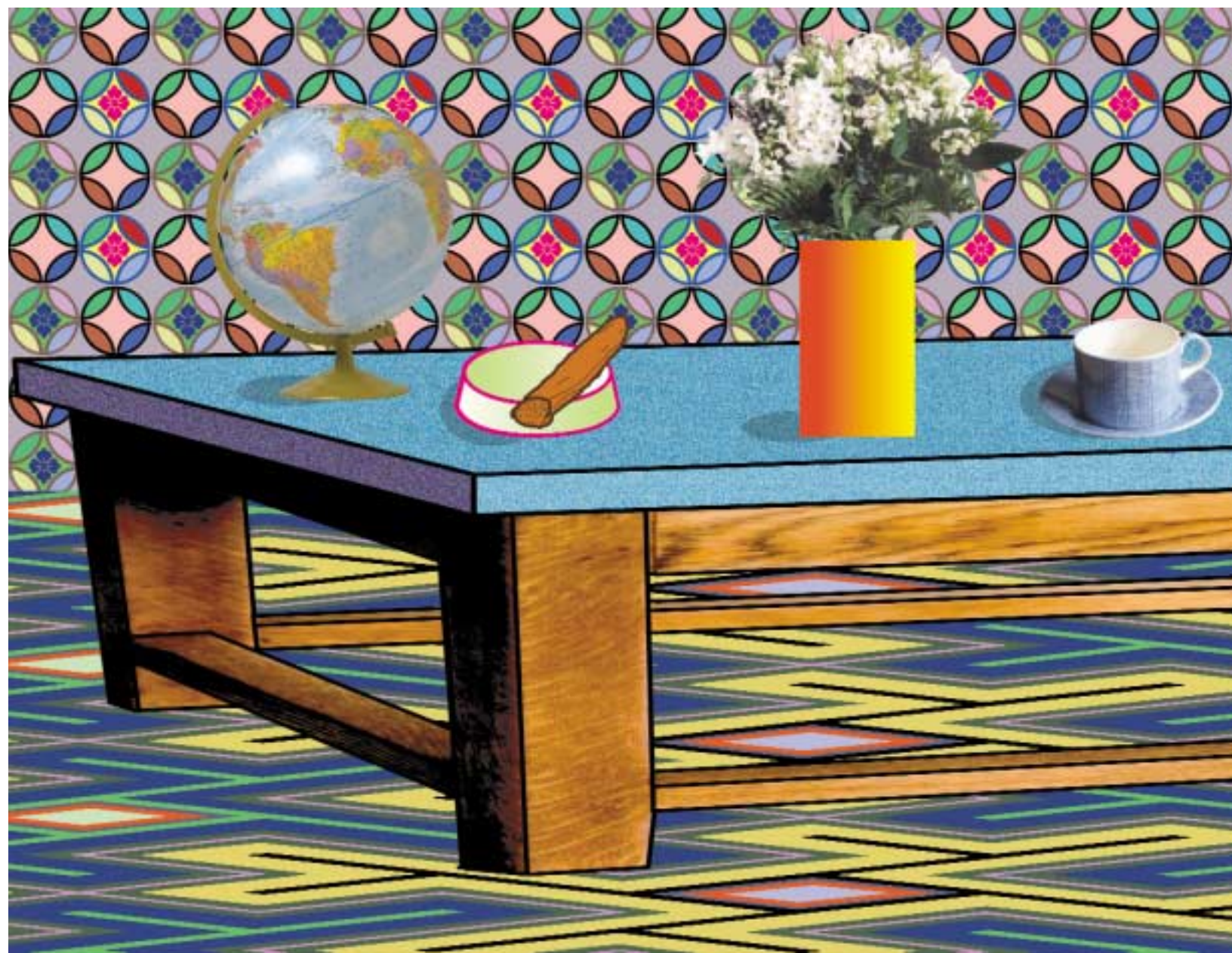
Integrated Output Solutions for the Complete Picture