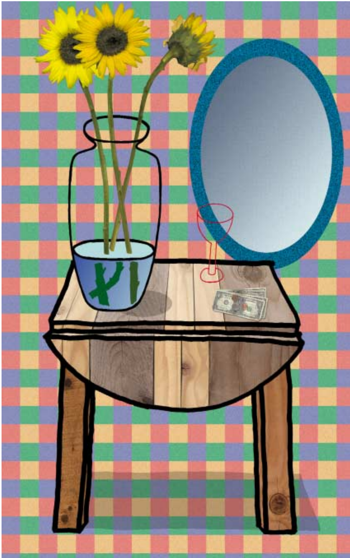
New York Table • Dennis de Caires

Integrated Output Solutions for Real Profit