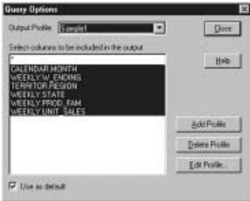
Figure 11. Figure C-11: Query Options Dialog Box

DB2 OLAP Server for AS/400 displays the SQL Database Login dialog box.