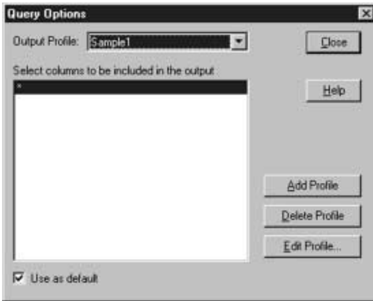
Figure 4. Figure C-4: Query Options Dialog Box