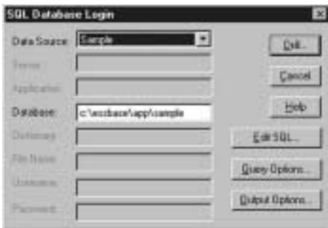
Figure 10. Figure C-10: SQL Database Login Dialog Box