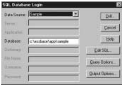
Figure 3. Figure C-3: SQL Database Login Dialog Box

The Client-Server icon appears while the server updates the Spreadsheet Add-in with the relevant information. The SQL Database Login dialog box appears: