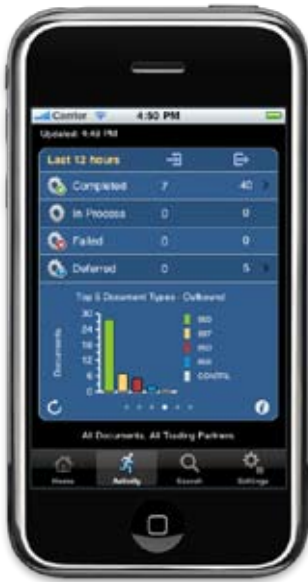
Sterling InFlight Data Management Mobile activity screen

Whether it be an individual transaction, general system health or overall transaction progress, this solution will help you find what you need from your mobile device.