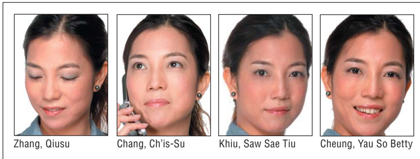
IBM Global Name Recognition technology recognizes that these seemingly different names are really four different cultural representations of the same name across Southeast Asia.