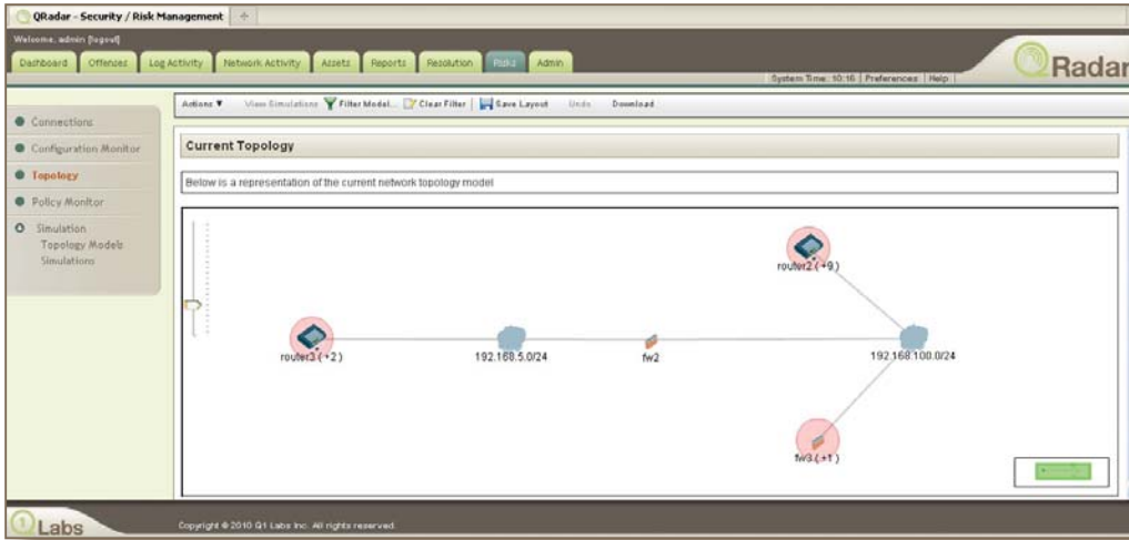
QRadar Risk Manager Topology Viewer