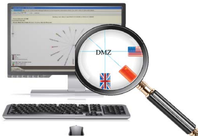
Risk Manager Connection Viewer

QRadar ® Risk Manager leverages and extends the value of a SIEM deployment to provide organizations with total security intelligence and greatly improves the ability to automate risk management functions in mission critical areas, including network and security configuration, compliance management, and vulnerability assessment.