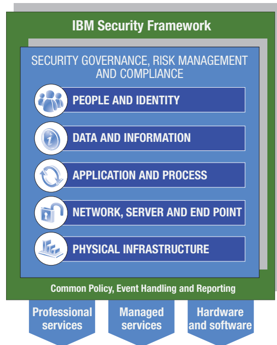
Figure 1: The IBM Security Framework enables a holistic approach to enterprise security, defining security capabilities in terms of the business resources that need to be protected.

Tivoli access management solutions are offered as part of the IBM Security Framework to deliver identity, data, and application security (see Figure 1). This framework was developed to offer enterprise security capabilities in terms of the business resources that need to be protected, dividing IT security needs into five discrete domains. These domains are addressed in a context of security governance, risk management, and compliance, and are supported by a comprehensive IBM portfolio of security hardware, cross-brand software, and services. The IBM Security Framework allows organizations to better understand and prioritize risks and vulnerabilities based on their potential to disrupt critical processes.