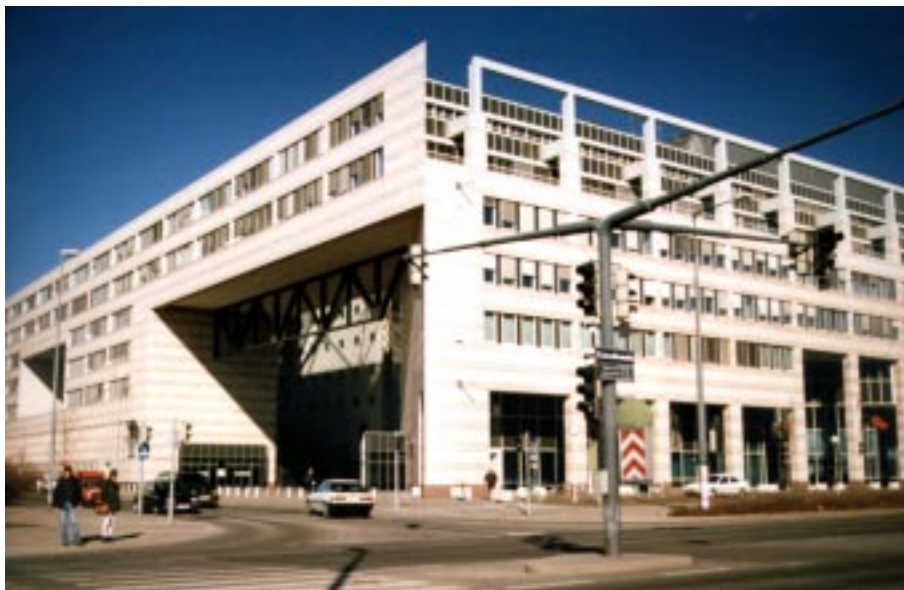
iT-Austria, Vienna, Austria

systems which deliver around-the-clock online services to locations all over Austria, managing about 13.6 million accounts. iT-AUSTRIA delivers these services to the customers and to the combined staff of 38,500 employees of the two financial groups.