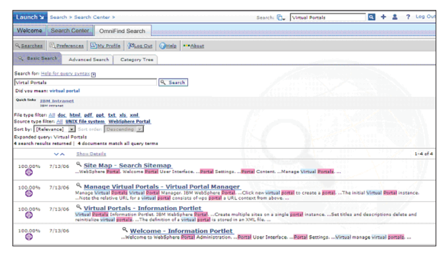
Figure 1. The OmniFind Enterprise Edition search portlet exposes all of the advanced search functionality available in OmniFind Enterprise Edition directly through WebSphere Portal.