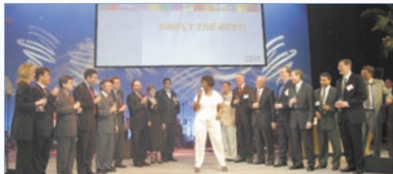
Grammy winner Irma Thomas salutes the IBM Beacon Award winners

Finalists: Sapiens (UK) Ltd www.sapiens.com (United Kingdom) Servion Global Solutions www.servion.com (India) Vormittag Associates, Inc. www.vai-solutions.com (United States)