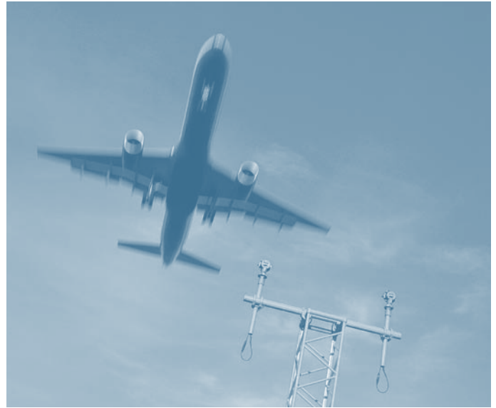
Boeing closely collaborated with its partners in designing its 787 Dreamliner

The Toyota Prius and the Boeing 787 are examples of products that have created highly profitable new market niches and changed the competitive balance in their respective industries. In each case, these companies have leveraged design technologies and collaboration with business partners to incorporate breakthrough technology into their products, and then developed new design and manufacturing processes and tools to bring these products to market ahead of the competition.