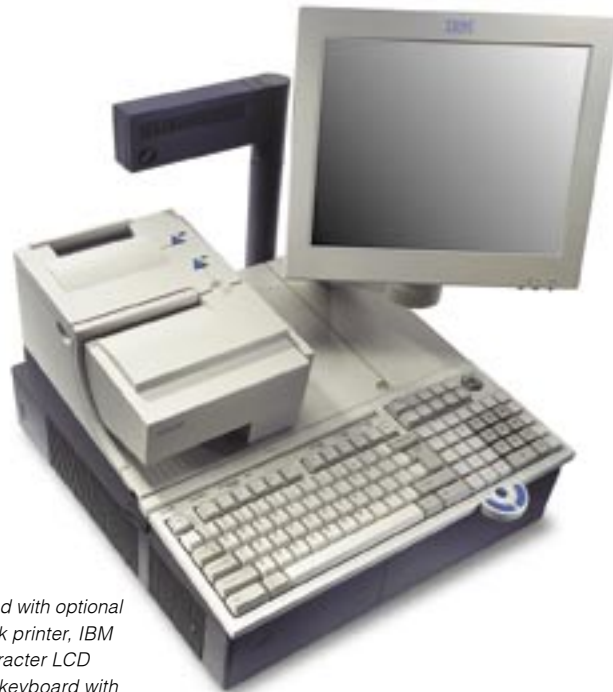
Model 347 shown configured with optional components: IBM SureMark printer, IBM SurePoint Solution, 40-character LCD and ANPOS Web-enabled keyboard with pointing device.