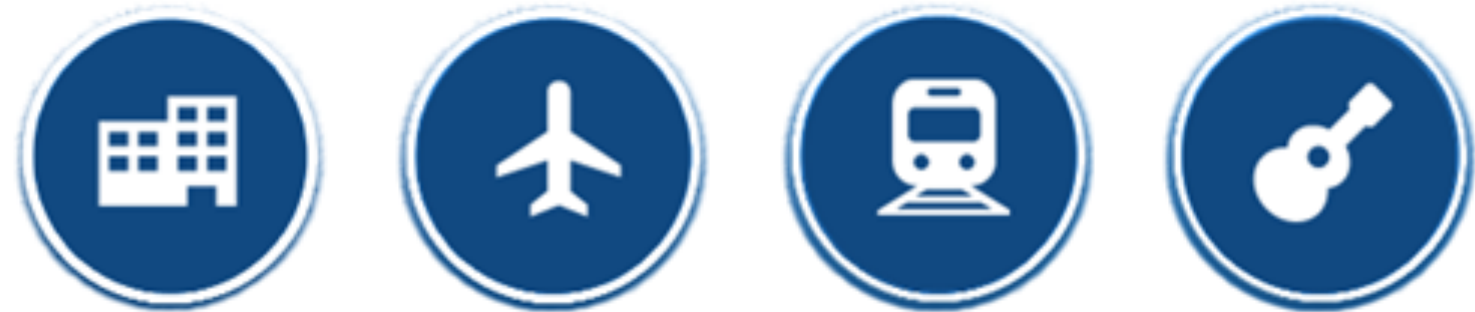
L'Arc En Ciel World Tour 2012 SOLD OUT IN 2 MINUTES