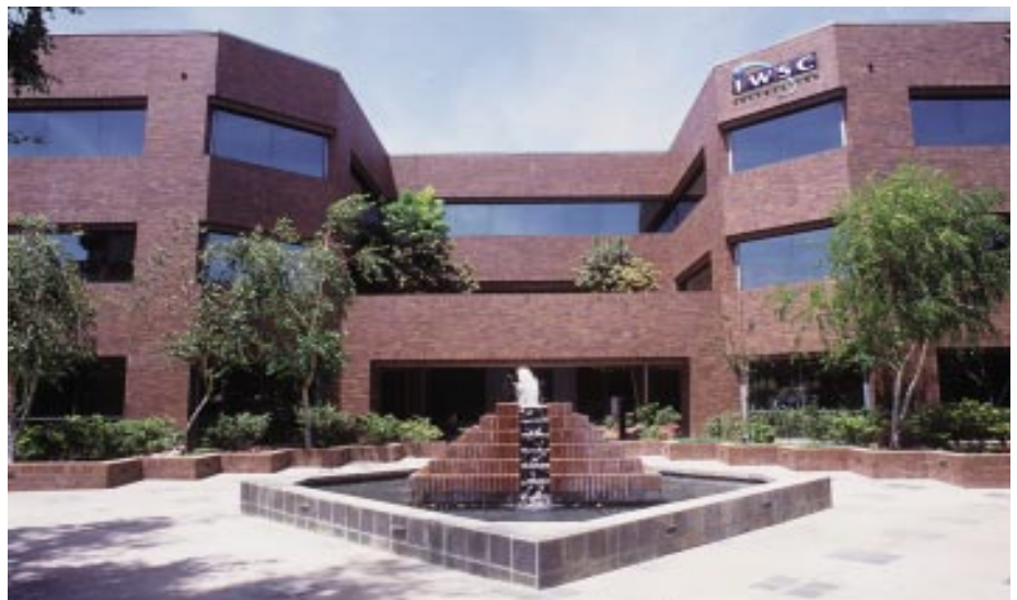
IWSC's headquarters located in San Diego, California

than having to visit multiple sites to buy all the products they want, consumers at 1WorldCenter are invited to browse with a single “shopping cart.” Says Hertz, “With a few clicks, shoppers can put a Bulova watch, a Wilson basketball, a Mont Blanc pen, and other items from as many stores as they wish into their cart. They can close the connection, sign on later from another computer and add or subtract from the cart before purchasing.” Through IBM's Net.Commerce, 1WorldCenter enables merchants to offer shoppers over 20