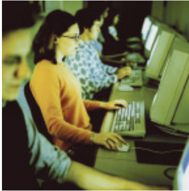
With TestManager, the sequence of both questions and answers for each test-taker can be automatically randomized to make cheating difficult.

TestManager is the remedy for this problem. Created by ACTS Corporation of Kingsland, Texas, TestManager is a Web-based exam solution delivered anywhere from an IBM S/390 Parallel Enterprise Server running the Linux operating system. TestManager offers reliability and scalability for hundreds of thousands of test-takers. And even if an Internet connection is lost, the power goes off or a PC fails, users can continue where they left off when the system comes back up.