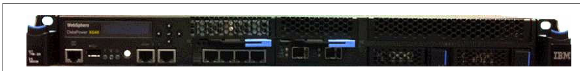
Figure 1 7198/9005 1U appliance

This new slimmer appliance is the same height but is much more capable than the previous 9235/9004 line. This platform features six Ethernet interfaces (two of which are 10 Gb) and two RJ45 serial-over-LAN administrative ports for management. It ships with two 300 GB hard disk drives with 300 GB total storage in a RAID 1 configuration.