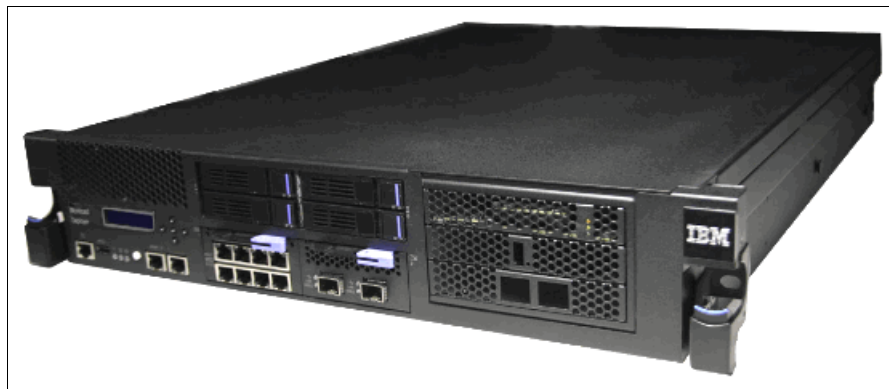
Figure 2 7199/9005 2U appliance