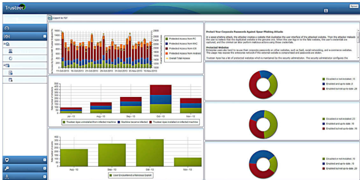
Figure 4-2: The Trusteer Apex dashboard provides enterprise security visibility.