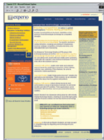
Experio Solutions' comprehensive e-business offerings include solutions for the Web and value chain optimization.