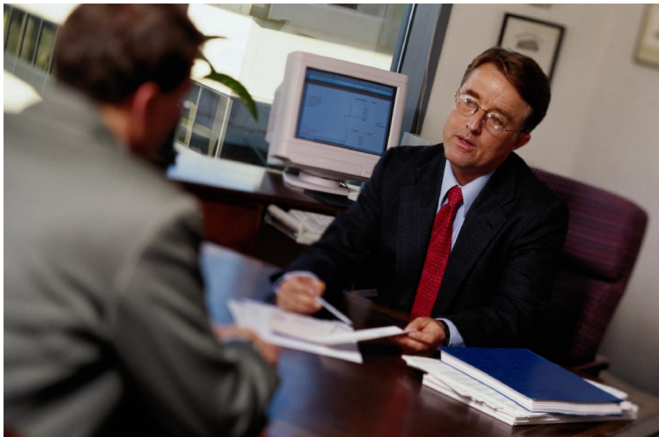
WebSphere Business Components Composer, a part of the WebSphere software multichannel banking solution, provides a set of components designed specifically for retail banking applications.

In e-business, speed is everything. To succeed, your business must be agile—changing constantly as markets shift and business goals evolve. You can't be locked into long development cycles and inflexible information systems. You need technology that can help you close the gap between your company vision and the deployment phases of its application development.