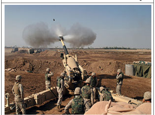
An M-198 155mm Howitzer of the US Marines firing at Fallujah, Iraq, during the Second Battle of Fallujah (November 2004).