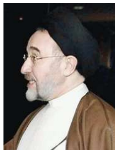
Outgoing Iranian president Mohammad Khatami

Outgoing Iranian president Mohammad Khatami said that the proposed nuclear fuel work would not include producing enriched uranium, but stressed that Iran would ultimately resume its uranium enrichment programme.