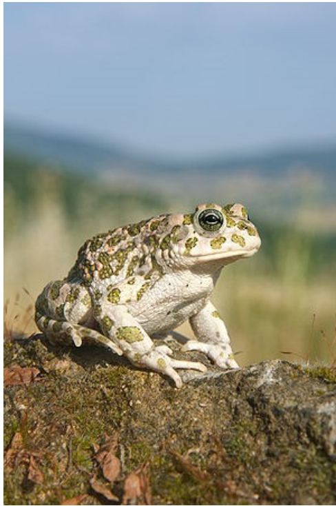
The female European green toad (Bufo viridis);

Licensed under CC-BY SA 2.5. Attribution to Richard Bartz.