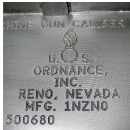
U.S. Ordnance flaming Bomb logo and 1NZNO acage code on a newly manufactured M2HB machine gun receiver (U.S. Ordnance)

U.S. Ordnance understands the importance of ensuring interchangeability for mature weapons systems such as the M2HB. They have already successfully demonstrated full interchangeability for the M60 weapons system with those produced by Maremont Corporation and Saco Defense. Their ISO established processes, procedures, quality assurance controls, production testing, and methods of manufacture ensures the level of quality required for all components of the M2HB machine gun are also maintained.