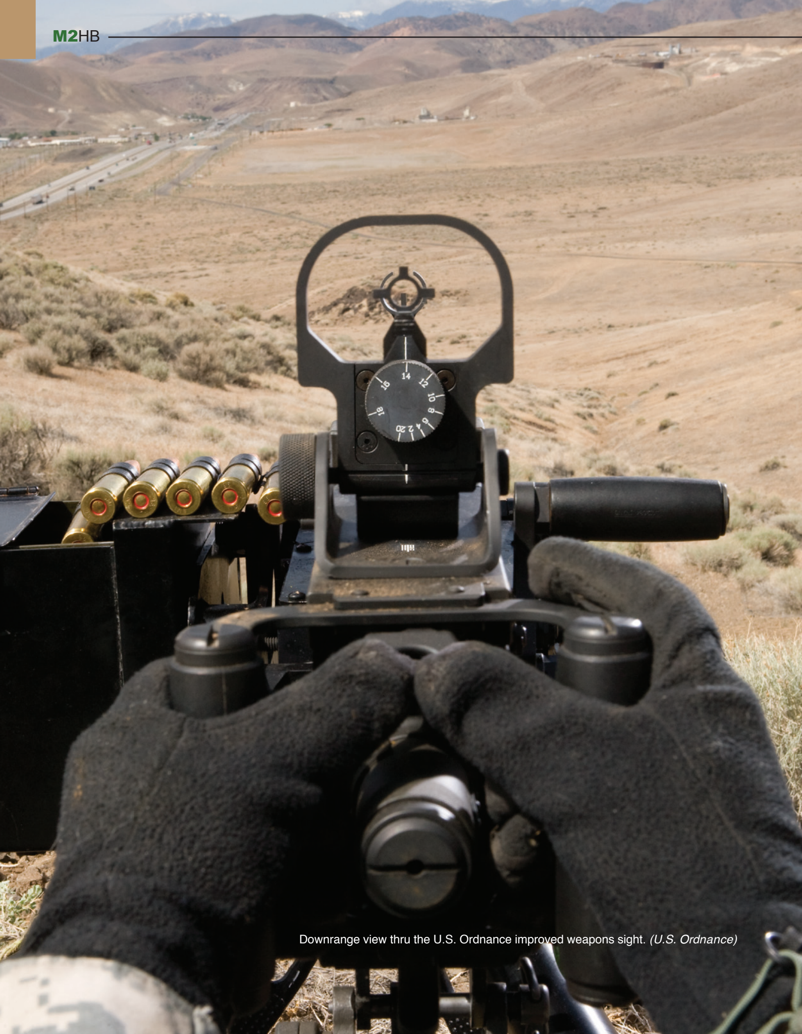
Downrange view thru the U.S. Ordnance improved weapons sight. (U.S. Ordnance)