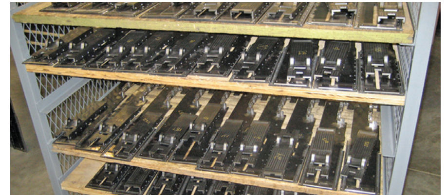
Newly manufactured U.S. Ordnance M2HB receiver components just prior to riveting.

In October of 2008, U.S. Ordnance took occupancy of its company owned, 68,000 square foot facility in the Tahoe-Reno Industrial Center. This custom building included expanded capabilities, such as an automated Phosphate Coating System, and an indoor live fire test range that can handle full auto .50 caliber Standard Ball Cartridge and .50 caliber High Pressure Test Cartridges, and a high security customs bonded warehouse.