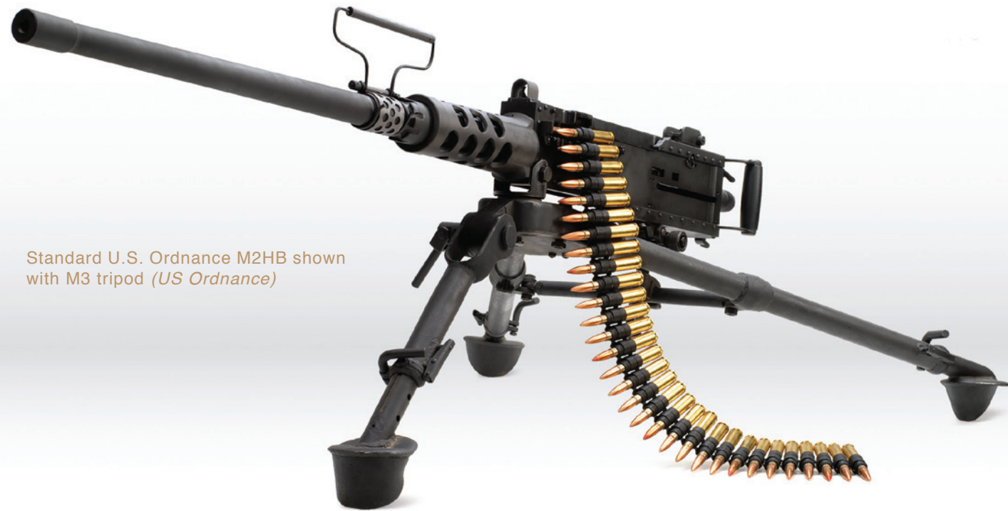
Standard U.S. Ordnance M2HB shown with M3 tripod

maintaining those original specifications. U.S. Ordnance customers benefit from extensive environmental endurance testing, such as drop tests, ice, mud and water immersion, to deliver the most reliable firearms. Each U.S. Ordnance machine gun produced undergoes proof firing, as well as function and accuracy testing before it leaves the factory. This 100% testing ensures quality control. Due to the success of their firearms worldwide and current production for the U.S. Government, U.S. Ordnance can assure availability of replacement parts in the future. In addition to their M2HB and M60 line they offer the M16/M4 variants, M203 grenade launcher, and M40A3 sniper system.